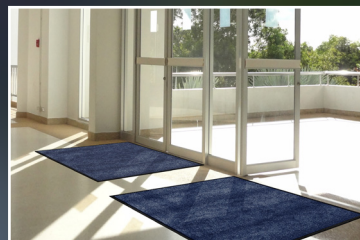
ColorStar® (PET fabric features 100% recycled content reclaimed from plastics)

By preventing contaminants from entering a facility, mats will substantially reduce the need for cleaning chemicals that might be harmful to building occupants and the environment. M+A is committed to developing and manufacturing eco-friendly products, reusing and recycling materials as often as possible.