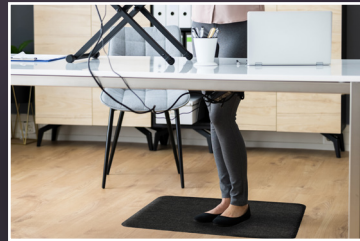
TuffComfort Standing Desk Mat

Prolonged standing puts pressure on the feet, leg muscles, spine, neck, and shoulders which can lead to chronic pain, injuries, and muscular disorders. By providing educational employees with anti-fatigue mats in standing areas, or even at their desks, it can increase productivity and reduce the pain associated with standing for long periods of time. Standing on an anti-fatigue mat at your desk burns calories, reduces energy consumption, alleviates stress to the back and legs, and also reduces fatigue as a whole.